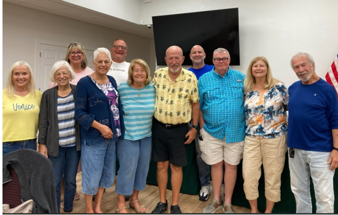
Winning Trivia Team

BROUGHT TO YOU BY THE COMMUNITY OUTREACH COMMITTEE