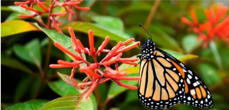
Monarch Butterfly on Firebush