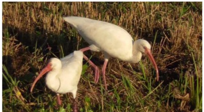
They made a stop along the river across from our dock before returning to roost in Gasparilla Sound.