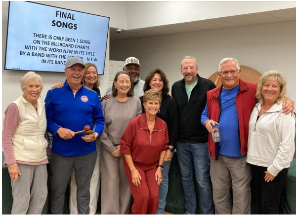
Winning Trivia Team WMU & COMPANY

BROUGHT TO YOU BY THE COMMUNITY OUTREACH COMMITTEE