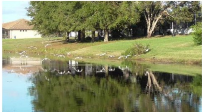
Flock of White Ibises returning from foraging along the Rotonda River