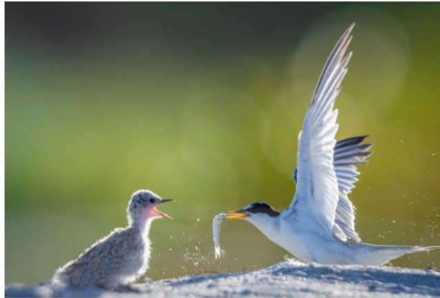
Least Tern feeding chick

Program was held on Wednesday, January 28th