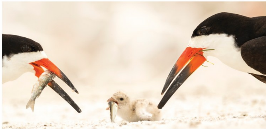
Black Skimmers feeding chick