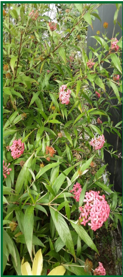
Panama rose ( Rondeletia leucophylla )

Why not start 2026 with an evergreen shrub that blooms in winter and brings fragrance to your garden? The Panama rose ( Rondeletia leucophylla ) has pink tubular flowers in clusters which appear off and on all year. It can grow to 10 feet tall, can be pruned to 3 feet and is 3-6 feet wide. Enrich the soil with compost or peat, and provide consistent moisture to obtain 1-2 feet of annual growth. Plant in full sun or part shade. It can take the heat.