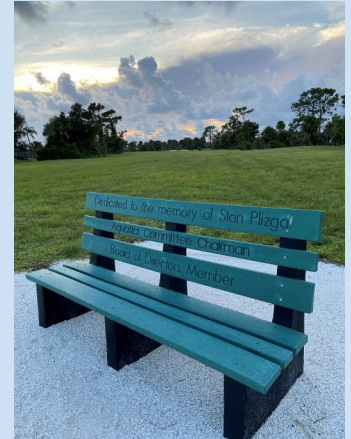
Memorial bench near L04 pond.