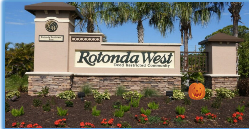
E-NEWSLETTER PUBLISHED MONTHLY BY THE ROTONDA WEST ASSOCIATION