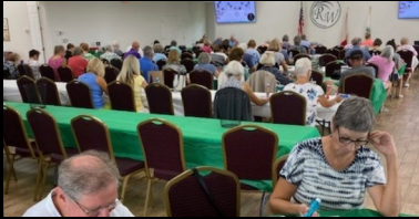
September 15th Games