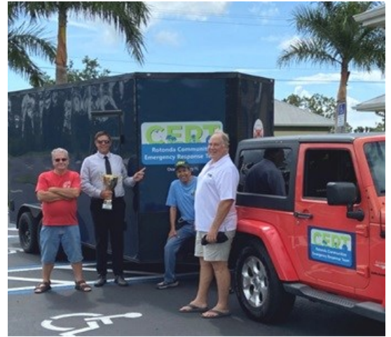
The Rotonda CERT Trailer

We have a Rotonda CERT trailer located at the RWA maintenance area that we continue to equip with medical supplies and debris clearing materials such as shovels and tools.