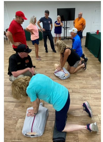
Firemen supervise the “Hands-On” training

In addition, the presenters reviewed what to do if someone is choking, or if you are choking and by yourself. Both scenarios require what is now called the “Abdominal Thrust”. The term “Heimlich Maneuver” is no longer used.