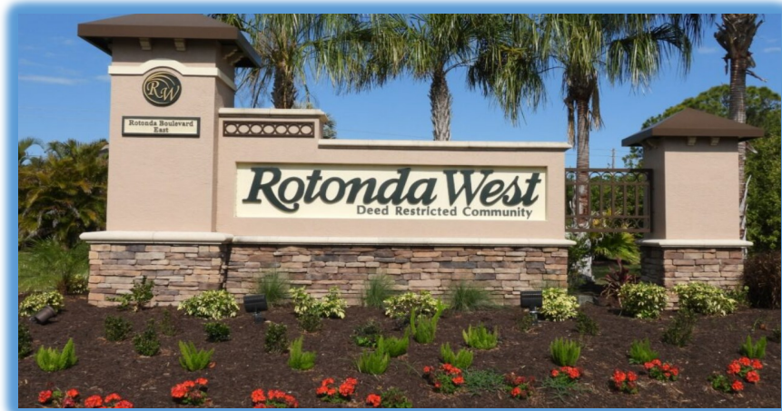
E-NEWSLETTER PUBLISHED MONTHLY BY THE ROTONDA WEST ASSOCIATION