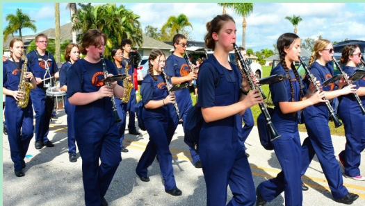
Lemon Bay High School Marching Band