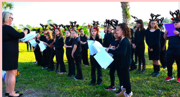
Elementary School Choir Entertains with Holiday Carols