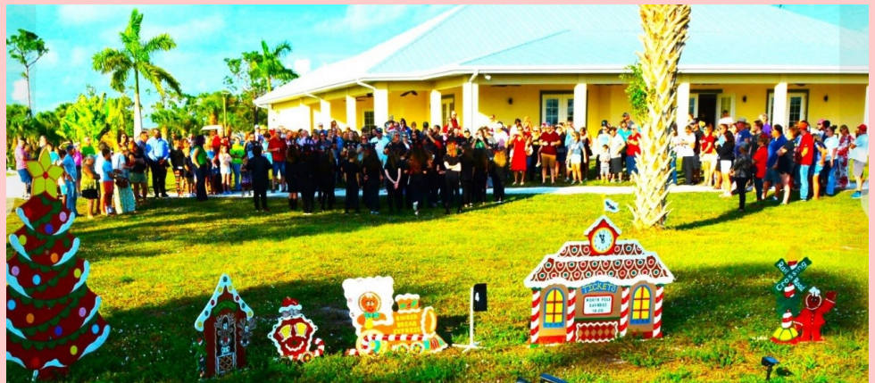
Rotonda West Residents Enjoy Holiday Stroll Event