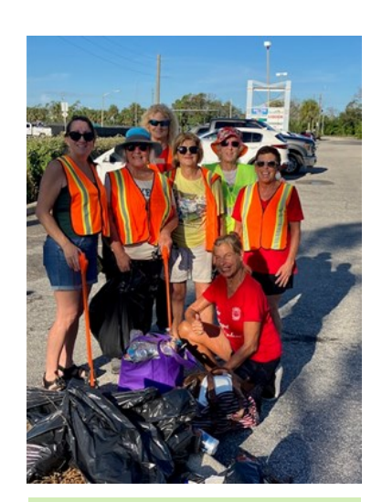
Above: Environmental Community Service Program Committee work to clean up Rotonda Blvd. West

bilities. Our club supported the Center financially by donating proceeds from the April 2023 Fashion Show. At this general meeting, our members donated over $300 worth of supplies to the Center. On September 25, seven RWWC members (& one husband) of the Environment Community Service Program Committee had a road cleanup day along Rotonda Blvd. West. The group collected 60 lbs of litter. 93 cans & bottles were recycled at the RW Community Park. Coming up on Saturday October 21<sup>st</sup> is the Fall Bazaar and on October 28<sup>th</sup> is the Rotonda Walk to End Alzheimer's.