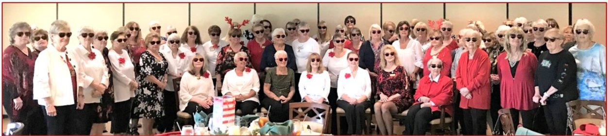
75 Women in Sunglasses: Our members reflecting Love, Respect and Kindness while enjoying our Christmas Meeting.

On October 26, 1973, 36 women, residents of Rotonda West, met with interest in forming a woman's club. On November 16th of that year, temporary officers were selected. The following month charter membership was closed with 43 members. In January 1974, a committee approved the Bylaws and Standing Rules. In April, the first officers were elected. On May 1, 1974, the Rotonda West Woman's Club was chartered as a member of the Florida Federation of Women's Clubs and on May 13th the first Officers were installed.