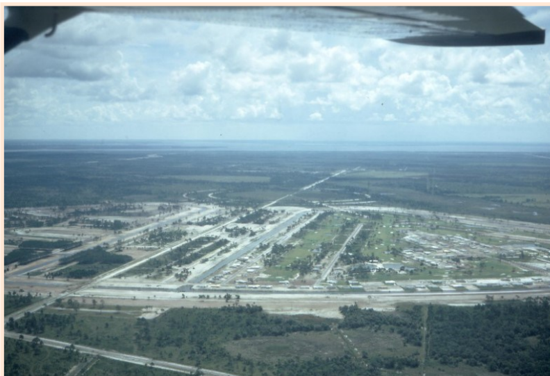
Aerial view of an early developing Rotonda West Community