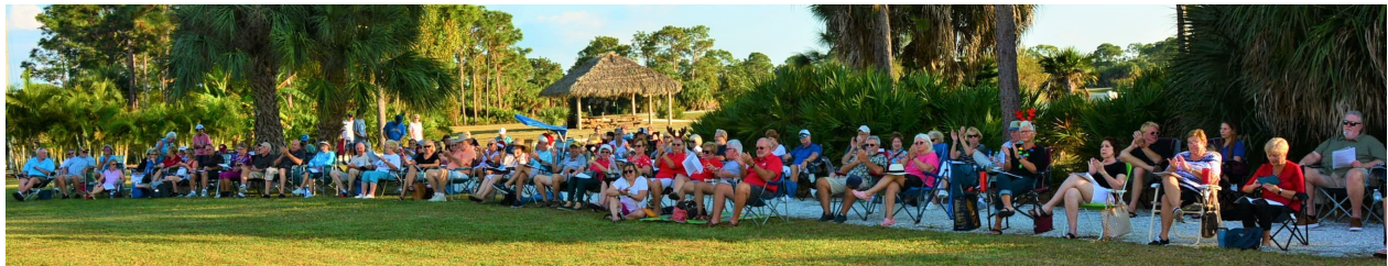
Beautiful Evening for the Music Festivities