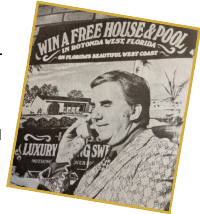
Ed McMahon Helping to sell lots in Rotonda

They put us up in the Sheraton Sandcastle on Lido beach, where they picked us up for a trip to the new community of Rotonda, south of Sarasota. We spent the day touring the property by air and by boat. The community was being heavily advertised by Ed McMahon and was hosting the Superstars athlete events on TV. It all looked so good that we kept the lot. Initially, the idea was that it would be investment property, and we had no idea that we would be living there someday!