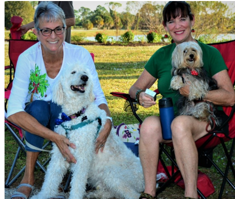
Everyone seemed to be enjoying themselves