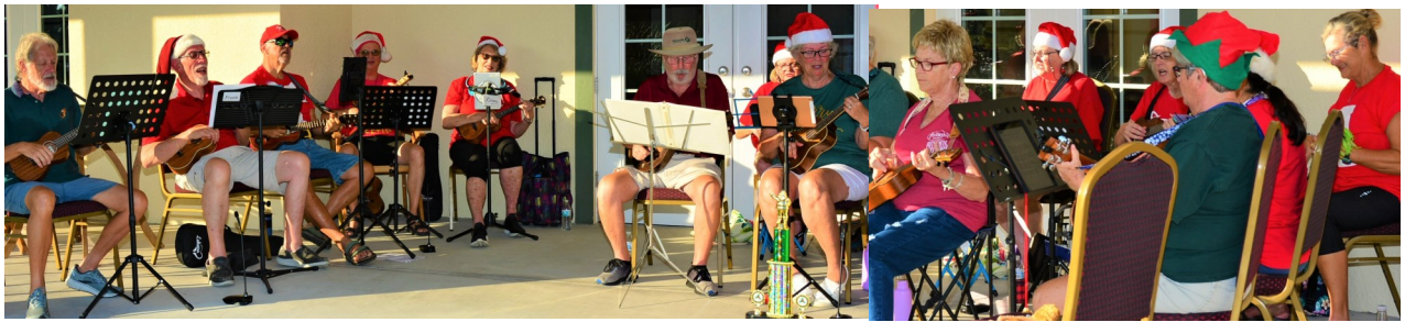
The Rotonda Ukulele Band