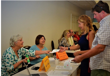
West Ways Newsletter