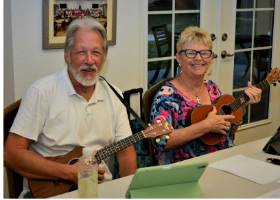
Rotonda Ukulele Band