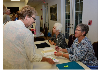
RWA Election Committee