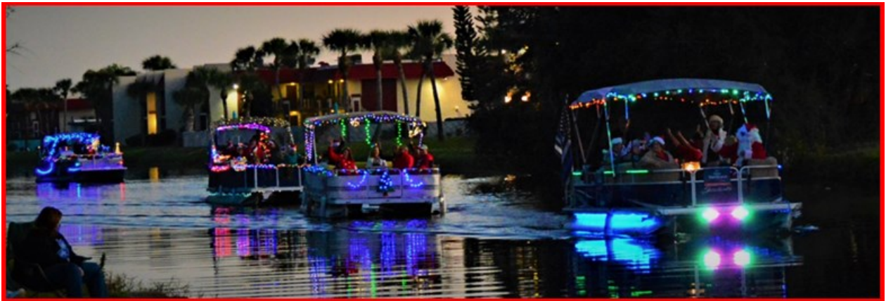
Kicking off the Holiday Season in Rotonda West

All in all, everyone, young and old, had a terrific time and we were all sorry to see the evening end.