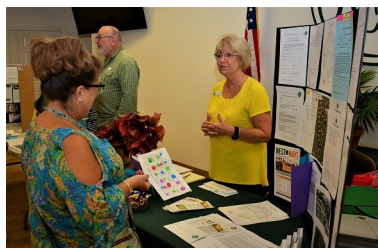
Rotonda West Assoc. Office