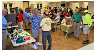
Rotonda Community CERT