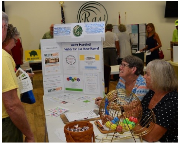
The Activities Committee