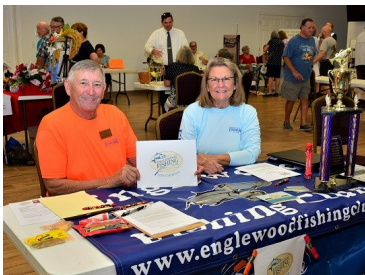
Englewood Fishing Club