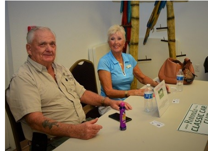
Rotonda Classic Car Club

On November 4th, the Rotonda West Association held an Open House which showcased over thirty clubs, committees, and organizations. There was something for everyone, as over 130 people in attendance went from table to table gathering valuable information, asking questions, getting answers, and making decisions about possibly getting involved in and volunteering for the groups.