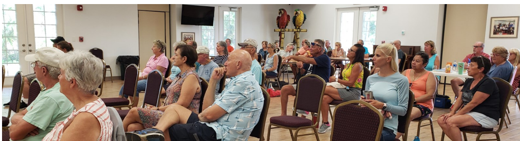
ROTONDA RESIDENTS CHILL OUT TO SOME COOL JAZZ!