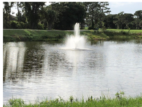
Bench overlooks beautiful pond at Broadmoor