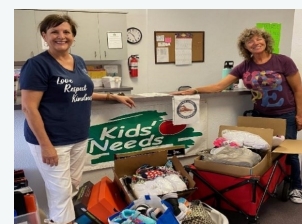
Woman's Club volunteers making a difference in our community!