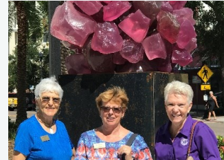
Field Trip to Chihuly Museum