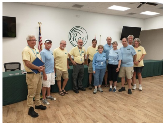
The Rotonda West CERT Team