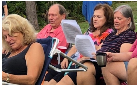
Community members singing along and enjoying the evening of music.