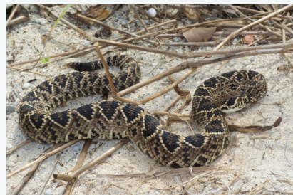
EASTERN DIAMONDBACK RATTLESNAKE