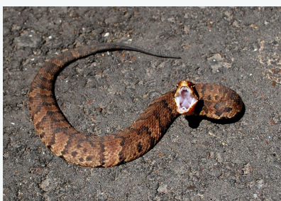
COTTONMOUTH / WATER MOCCASIN