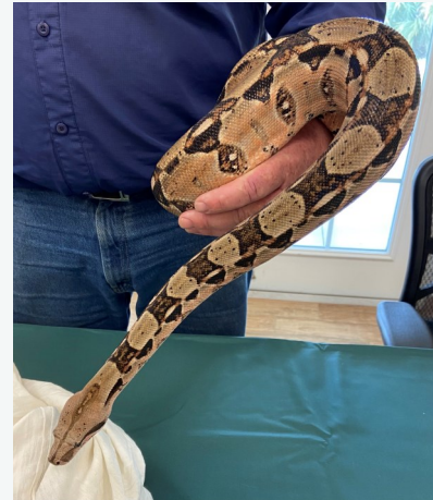
Columbian Red-Tailed Boa