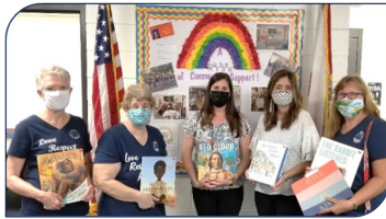
Myakka River elementary School Books Presentation