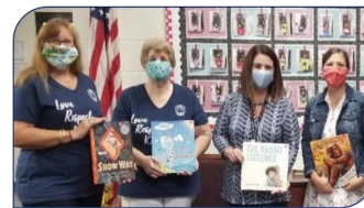
Vineland Elementary School Books Presentation