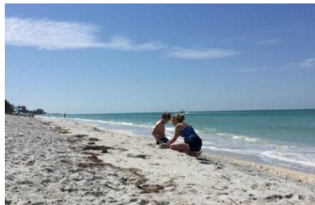
Mother and son enjoying the beach.