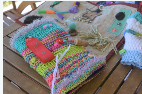
Tubular-shaped fidget sleeves help with the need to touch/grab by the compulsive, ever-moving fingers of memory patients.