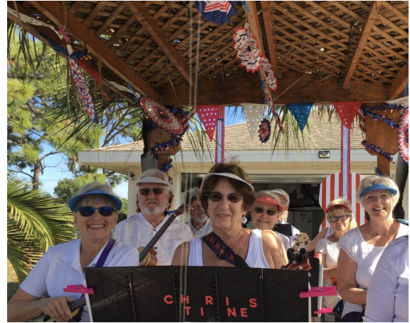
The Rotonda Ukulele Band in Rotonda's Christmas Parade 2019