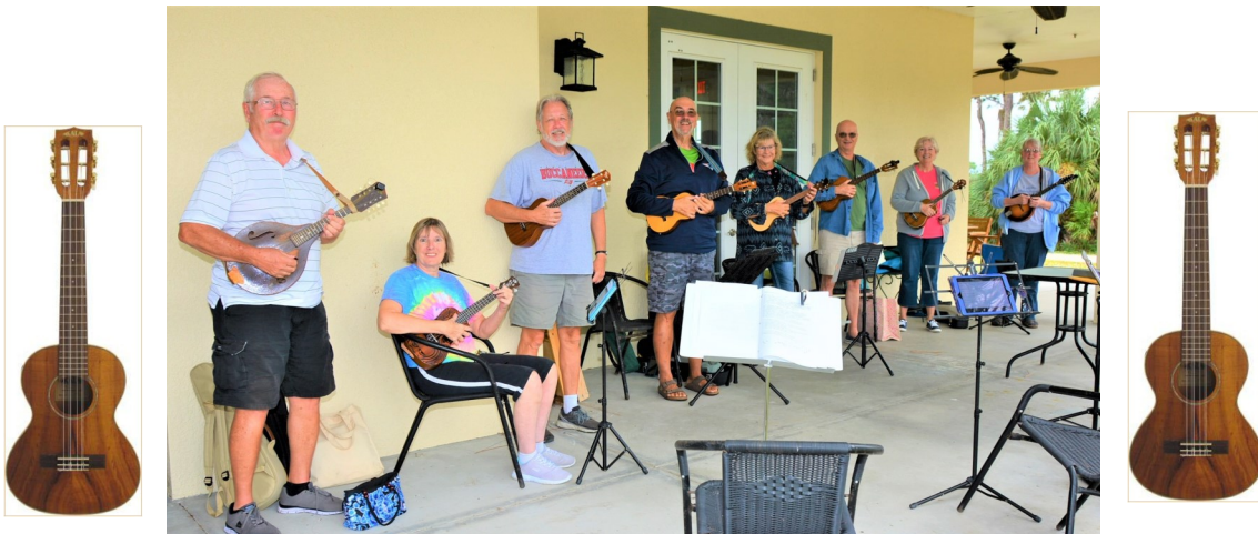
Practicing on the side porch of the Community Center

Playing and singing with the group quickly builds confidence. Soon you are playing for friends and family. The Rotonda Ukulele group has performed in the Rotonda Christmas Parade and has been asked to play for a local adult home.