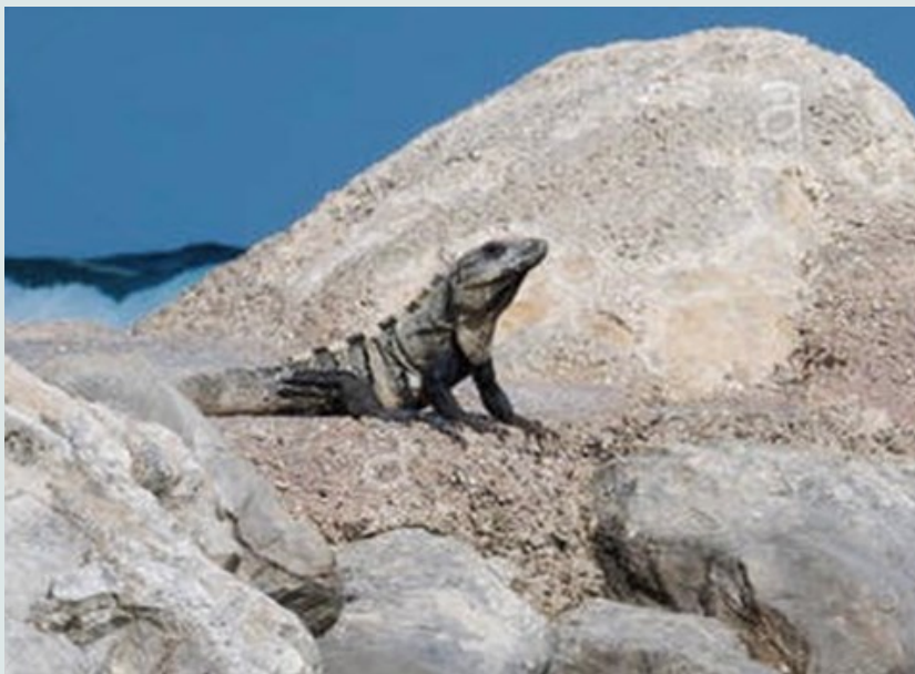
Mexican Spiny Tailed Iguana