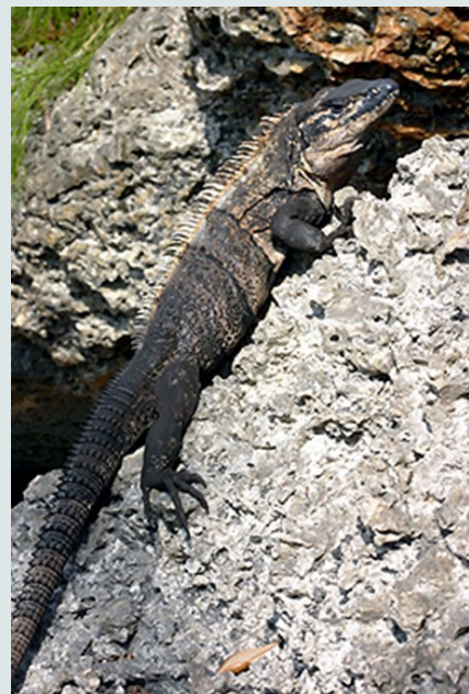
Black Spiny Tail Iguana